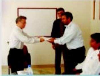
Long Service Award Ceremony