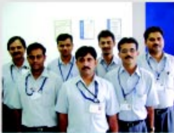
Operations promoted in Staff Canteen