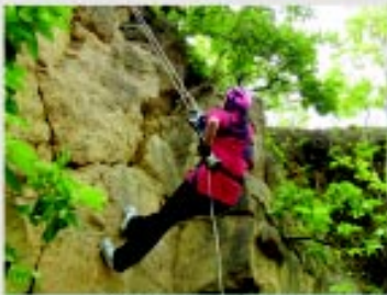
Old Board Training - Rappelling