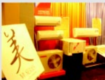
AC products on display during launch