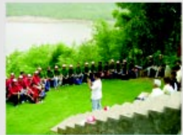
Old Board Training - Review & Feedback