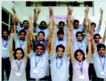
Young HRGJ - Trainers 2005-07