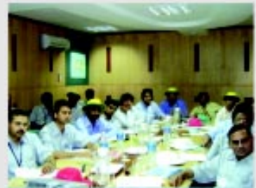
Charity Workshop - Six Hat Technique