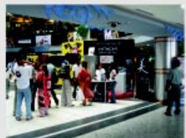
Consumer feedback in progress during mall activity