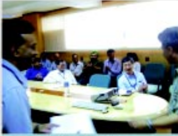
Long Service Award Ceremony