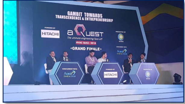
Glimpse of AQUEST'18