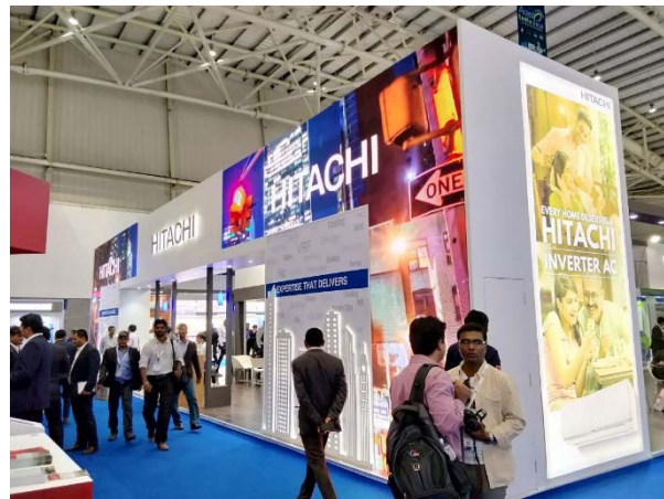
JCH-IN Stall Entrance- Promoting B2C