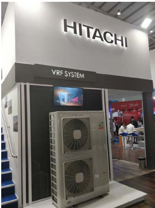
Set Free Kyosho Front Flow Display