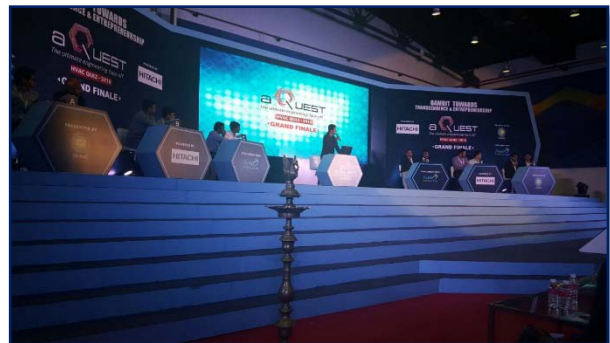
Glimpse of proceeding aQUEST-Quiz Competition