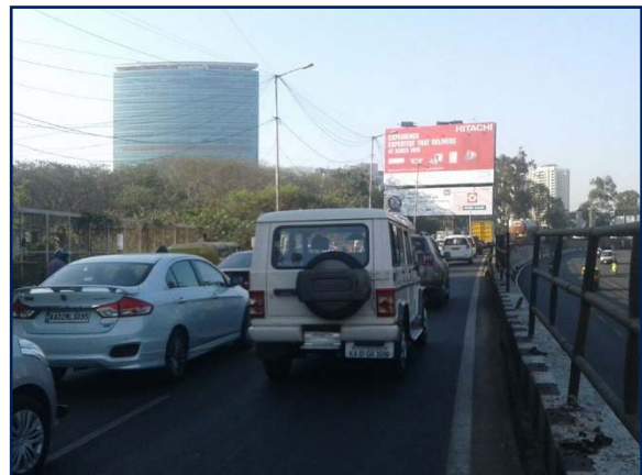
Glimpse of Hoardings placed in Bangalore for ACREX'18