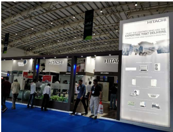
JCH-IN Stall Entrance- Promoting B2B