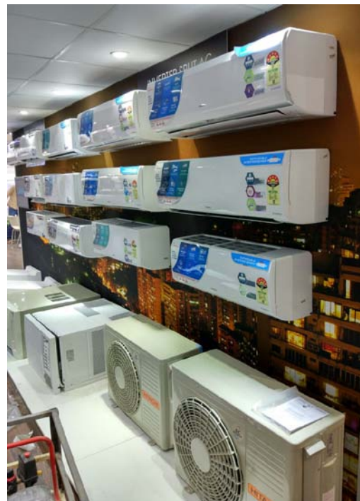
Display of RAC Range of the season